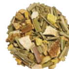
GINGER LEMONGRASS HERBAL TEA

A sweet and delicate green tea with notes of honeyed citrus and spring flowers.