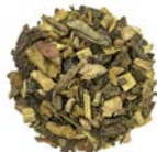
INVIGORATE GREEN TEA

A defense-strengthening blend featuring echinacea, ginger, and elderberry.