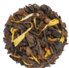
MOUNTAIN OOLONG OOLONG TEA

A deep, dark tea, punctuated by the lush taste of peach.