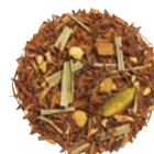
WINTER CHAI HERBAL TEA

Orchard-ripe fruit and berries infused with warm baking spices.