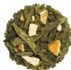
WILDFLOWER HONEY CITRUS GREEN TEA

A deep, dark tea, punctuated by the lush taste of peach.