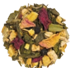
DEFENSE GREEN TEA

A defense-strengthening blend featuring echinacea, ginger, and elderberry.