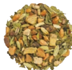
PURIFY HERBAL TEA

An energizing, full-bodied blend with beetroot, ginger, ginseng, and matcha powder.