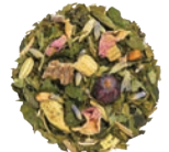
SERENITY HERBAL TEA

A fruit-forward, complexion-friendly blend with rosemary and citrus.