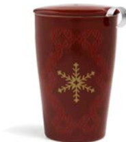
701938 NEW WARMING JOY

This contemporary ceramic tumbler with a stainless steel infusing basket makes steeping loose tea by the cup simple. The innovative double-walled construction keeps tea hot. Makes a generous 12-ounce cup.