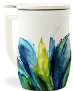
705806 BLUE AGAVE