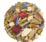
TROPICAL PASSION FLOWER HERBAL TEA

Citrus notes balanced by cool spearmint and mellow licorice.