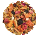
RADIANCE HERBAL TEA

A mellow yet juicy citrus-forward blend with purifying mate and dandelion root.