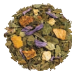
WHITE GINGER PEAR WHITE TEA

Fragrant cinnamon, clove, and orange for a classic that evokes the holidays.