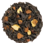
SWEET ORANGE SPICE BLACK TEA

Cinnamon, cloves, and ginger bring a spicy warmth to this festive black tea.