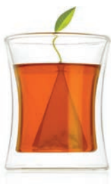
30412 POOM DOUBLE-WALLED GLASS 4 CASE PACK