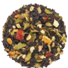
NEW GINGER SNAP BLACK TEA

Cinnamon, cloves, and ginger bring a spicy warmth to this festive black tea.