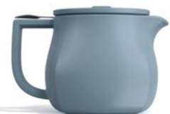
715860 STONE BLUE