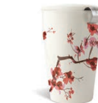
20865 CHERRY BLOSSOM