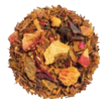
HARVEST APPLE SPICE HERBAL TEA

A delicate white tea brimming with ginger and pear notes.