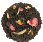
CITRUS EARL GREY BLACK TEA