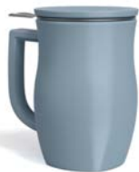
705810 STONE BLUE