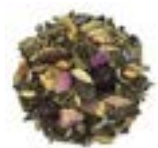
SERENITY herbal tea

A fruit-forward, complexion-friendly blend with rosemary and citrus.