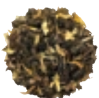
CUCUMBER MINT green tea

A 142060 PETITE PRESENTATION BOX (10 INFUSERS) 701060 KATI® STEEPING CUP & INFUSER