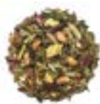
PURIFY herbal tea

An energizing, full-bodied blend with beetroot, ginger, ginseng and matcha powder.