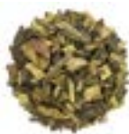
INVIGORATE green tea

A defense-strengthening blend featuring echinacea, ginger and elderberry.