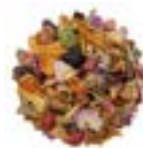
RADIANCE herbal tea

A mellow yet juicy citrus-forward blend with purifying mate and dandelion root.