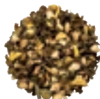
WHITE GINGER PEAR white tea

Cool spearmint and basil with a hint of sweet blueberries.