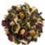
DEFENSE green tea

A defense-strengthening blend featuring echinacea, ginger and elderberry.