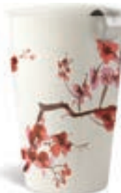
20865 CHERRY BLOSSOM