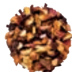
RASPBERRY NECTAR herbal tea

Tropical fruit notes infused with juicy papaya and delicate flower petals.