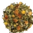
LEMON LAVENDER herbal tea

Delicate white tea leaves plus a hint of pear and spicy ginger.